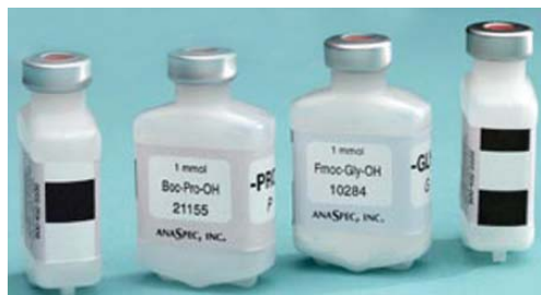
For ABI 433A & 431A